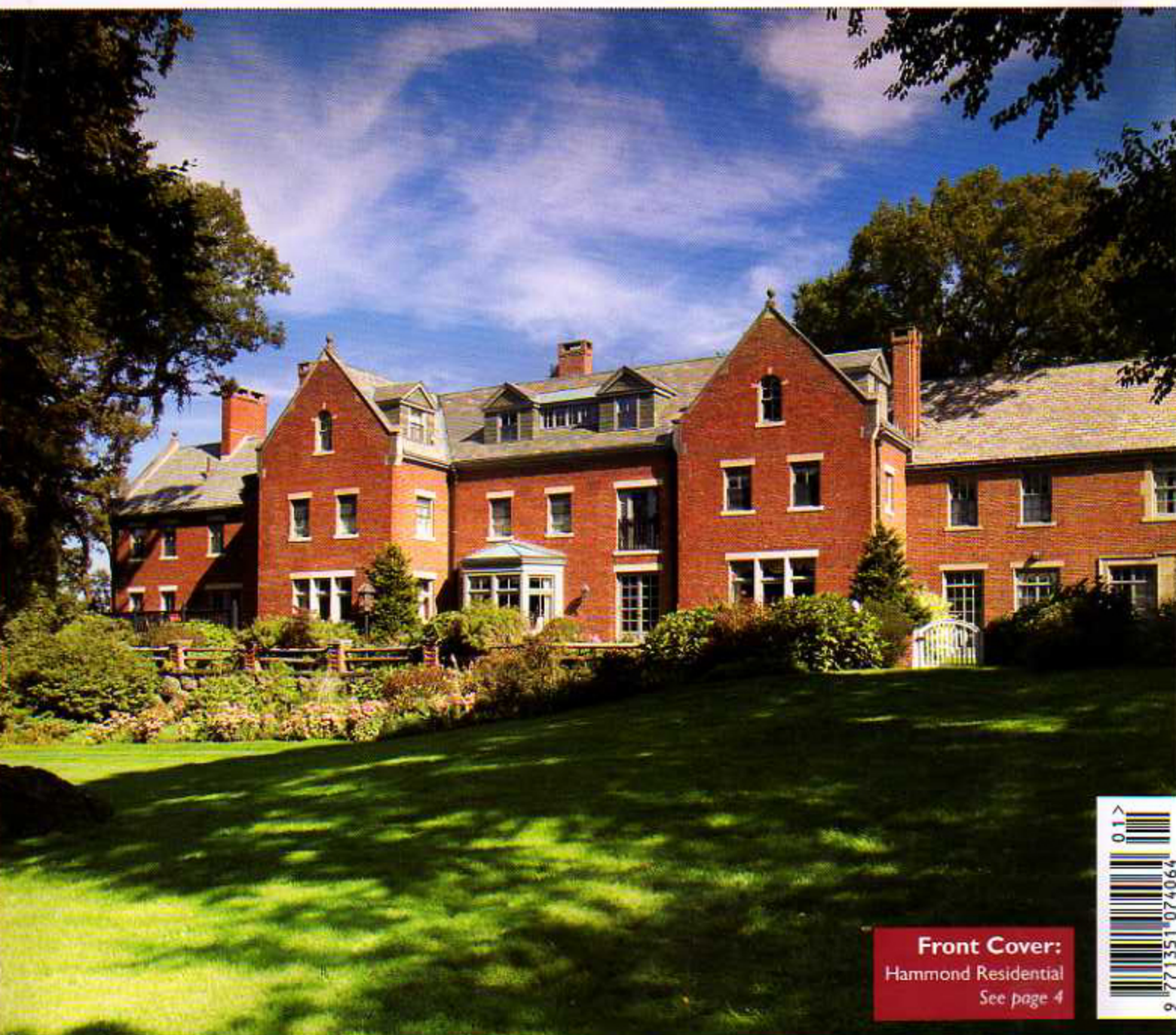
Front Cover: Hammond Residential See page 4

FREE INSIDE: Europe & Africa's Best Supplement